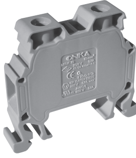
MRK 10 Order No: 1042